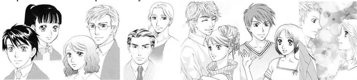
Figure 2. Close-ups of the facial features

Source: Hime, K. (2006). How to draw manga computones vol 4: Portraying couples. (Vol 4). Graphic-sha. Has been reprocessed by the author.