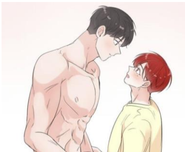
Figure 3. Dowan and Chamin

In Love is an Illusion, Room to Room, and Path to You , the feminine and masculine males can be identified from their physical build even from the first glance. The three masculine males, Dojin, Dowan, and Jensen are drawn as tall and muscular with wide shoulders while Hyesung, Chamin, and Nathaniel, the feminine males, are depicted as slender and delicate. For instance, it can be seen from Figure 3 below the big difference in the body build of the feminine and masculine male from Room to Room .