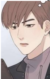
Figure 5. Jensen's close-up