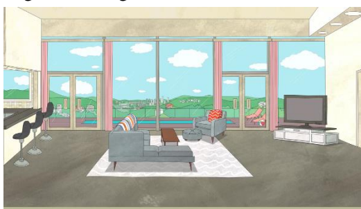
Figure 7. BoJack's house.

To provide some context, BoJack was filming a scene for Philbert with Gina Cazador, his co-star and girlfriend at that time. However, BoJack got carried away and kept choking Gina until she almost ran out of oxygen even though the director had said, "Cut!" This horrifying incident happened in The Showstopper (Season 5, Episode 11). From a mise-en-scène standpoint, the setting of the filming was a carbon-copy of BoJack's house. The similarity did not help BoJack to set boundaries between his life and his role as Philbert . Moreover, in the scene, Flip and Mr. Peanutbutter stood by as they watched BoJack assaulting Gina. The blocking of the scene emphasized that they were only bystanders who did not bother to intervene. BoJack's childhood trauma affected him so deeply that he turned out to be as violent as his father.