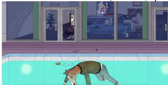
Figure 8. BoJack floating unconscious in a pool.

BoJack's third coping mechanism is suicide attempt. BoJack's attempts to end his own stemmed from his parents' maltreatment. Children who were traumatized would grow up to be more susceptible of mental health problems and life-threatening activities, like suicide attempts (Angelakis et al., 2020). There are a few instances where he tried to kill himself, but the one in which he almost succeeded was in Nice While It Lasted (Season 6, Episode 16):