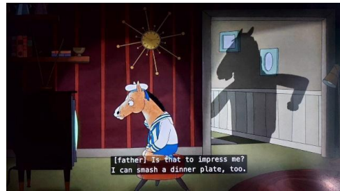
Figure 2. Butterscotch's silhouette throwing a plate to the floor.

The picture above shows BoJack who was trying to watch Secretariat on national television, with Butterscotch's silhouette who threw a plate. Butterscotch's and Beatrice's voices overpowered the television sound. During this quarrel, BoJack did not see his parents directly, whereas the viewers got a glimpse of their silhouette. However, it was enough to depict how children are exposed to domestic violence. From the viewpoint of mise-en-scène , young BoJack was presented smaller than his father's silhouette, which symbolized how small and powerless he was compared to his parents. He also looked away from the fight and watched the television from proximity, showing how he distracted himself from his parents' fights. Children who witnessed domestic violence are more susceptible to cultivating mental health issues in adulthood. This became true for BoJack. In Stupid Piece of Sh*t (Season 4, Episode 6), the series portrayed BoJack's inner battles with his mental struggles through animated doodles. The following screenshots show BoJack's doodles