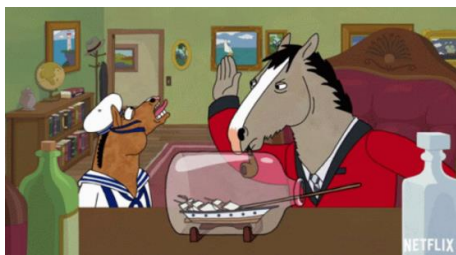
Figure 4. Butterscotch slapping BoJack.

As a victim, young BoJack was not exempt from physical abuse. In BoJack Hates the Troops (Season 1, Episode 2), Butterscotch slapped his son when he gave an unsatisfactory answer. The following screenshots are the proof of the incident: