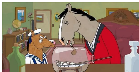
Figure 5. BoJack tearing up.

The sequence shows how traumatizing Butterscotch's physical torment was for BoJack. From the viewpoint of mise-en-scène , the scene uses medium-shot to fit two people in it, otherwise called two-shot in mise-en-scène (Lewis, 2014). A study shows that adults who are abused as children are more susceptible to getting into abusive relationships or become abusers themselves (Yang et al., 2018). This is due to the children subconsciously learning that the abuse is the right way to treat other people (Child Welfare Information Gateway, 2019). BoJack was no exception, with an example being an incident during the filming of Philbert :