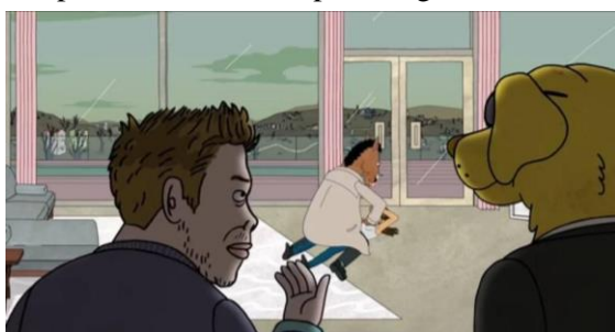
Figure 6. BoJack choking Gina.

The sequence shows how traumatizing Butterscotch's physical torment was for BoJack. From the viewpoint of mise-en-scène , the scene uses medium-shot to fit two people in it, otherwise called two-shot in mise-en-scène (Lewis, 2014). A study shows that adults who are abused as children are more susceptible to getting into abusive relationships or become abusers themselves (Yang et al., 2018). This is due to the children subconsciously learning that the abuse is the right way to treat other people (Child Welfare Information Gateway, 2019). BoJack was no exception, with an example being an incident during the filming of Philbert :