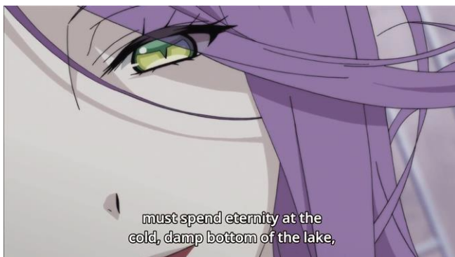
Second picture subtitle: must spend eternity at the cold, damp bottom of the lake.