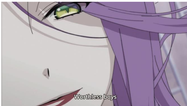
First picture subtitle: Worthless boys Source: Diabolik Lovers episode 7.

Sakamaki Cordelia, the mother of Sakamaki Ayato, Kanato, and Laito in Diabolik Lovers , is a whimsical mother who has left such a deep wound on her children. Despite appearing only in several episodes, she is a mother of a strong character that has left a terrible scar on her children, making them the way they are now. Sakamaki Cordelia willingly threatens her children to make her obey her, causing her children to fear and hate her. Cordelia threatens her oldest son, Ayato, whenever he does not want to do what she told him to do, and her level of threat is not on a level of taking children's toys away from them. In episode 7, when Ayato openly complains that he is tired of studying all the time, Cordelia forces him to do so anyway.