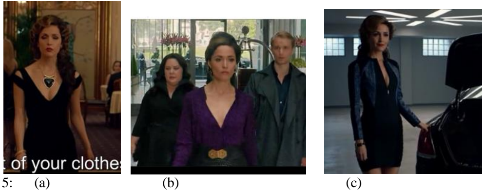
Figure 5: (a) (b) (c)

Rayna who has better style and more attractive appearance judge Susan's look, she said that Susan's look is hideous. It means that she knows the better style. This scene shows how male consider attractiveness is different from how female considered attractiveness.