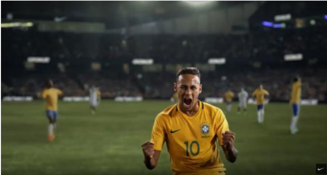
Figure 3. The use of Neymar as an actual professional athlete in Nike's video commercial - Unlimited You

However, the visual expression of Nike video commercial does not stop at that point as it further defines success to the next level by using actual professional athletes who are widely known throughout the world for their career in sports. Nike tries to use metaphor which pictures professional athletes as a signification of success which might be an inspiration to further motivate its audiences. The use of professional athletes as a metaphor in the video commercial is to picture successful people with connotatively signify the idea of success. Furthermore, the athletes are pictured as people who have a high endurance and is very confident in themselves to further hone their skills by doing unconventional training program. Then, their success is pictured with them dominating the game. By doing so, Nike wants to use professional athletes as a signification of success which is achieved through extreme training which requires confidence and high endurance. Essentially, the visual expression in the first video commercial define success by picturing unusually sports activity, and professional athletes with the aim to associate success with endurance and confidence while motivating its audiences. Its idea of excellence concept is pictured through the video commercial which connects the idea of success with high endurance, and confidence.