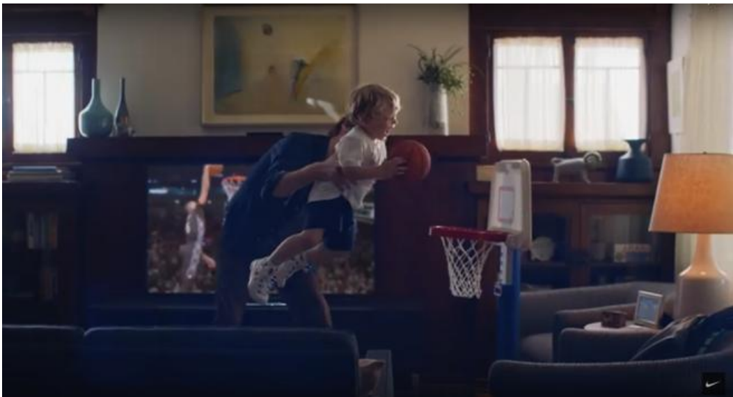
Figure 1. The highlighted visual expression in Nike's video commercial - Unlimited You

The support from the visual expression in the video commercial makes more sense of the motivational plot employed in the advertisement as the audiences could measure the degree of extremity of the activity by seeing the activity directly. Essentially, the visual expression is there for the audiences to see for themselves of what is meant by unusually extreme activities which are pictured in the advertisements. By doing so, the visual expression strengthens the motivational plot employed in the video commercial of Nike.