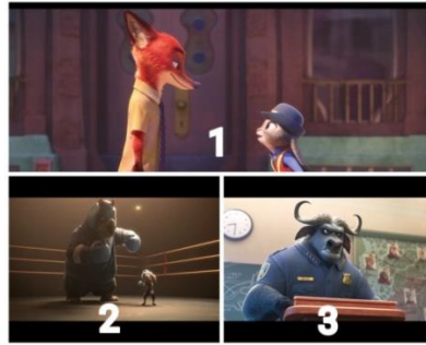
Picture 1 The representation of masculine appearance such as tall, big, or broad-shouldered body for the male characters in Zootopia .

Some other traits such as males being strong and dominant can also be seen portrayed in the movie visually. For example, there is a scene where Judy is having a fight with Gideon, her friend. In this scene, Gideon can be seen much more dominant and stronger when compared to Judy. Judy can also be seen losing against Gideon in this fight which proves that Gideon is more dominant and stronger than Judy is.