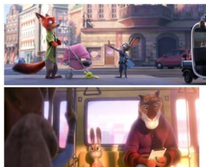
Picture 2 The the representation of feminine appearance for female characters such as small and short body when compared to the males.

The representation of female characters in Zootopia also follows the traditional gender stereotypes. Female characters are mostly depicted in feminine ways. For example in term of appearance, they are mostly represented having small and short body when compared to the male characters. The representation can be seen in the picture 2.